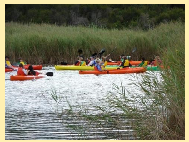
Not too far into our paddle, we came across a group of school kids in a mix of single and double kayaks. They seemed to be enjoying the exercise.

The kayaks were soon launched and five brave souls headed off up the river. Noelene stayed behind to look after their dog.