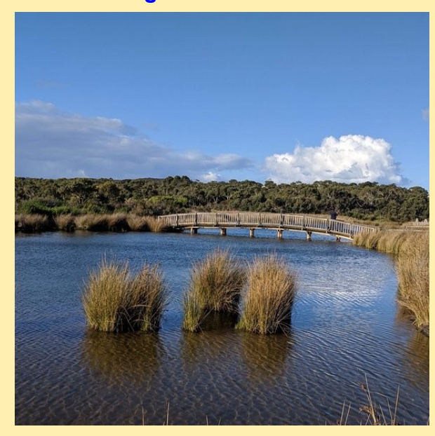
Back in the kayaks, we continued on our way. The canal wound around a heavy reed area and we had to duck under another footbridge.

Soon we came to a small gravel area near a bend in the canal and decided to stretch our legs.