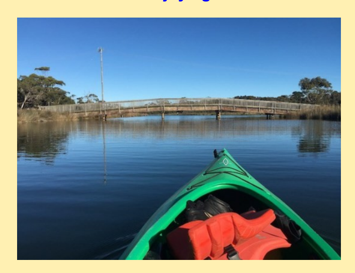
A little further on, we had to duck under a pedestrian bridge to continue our journey up river.

The paddling was easy, the water was flat and we had a slight tail wind. The easy progress gave everyone a chance