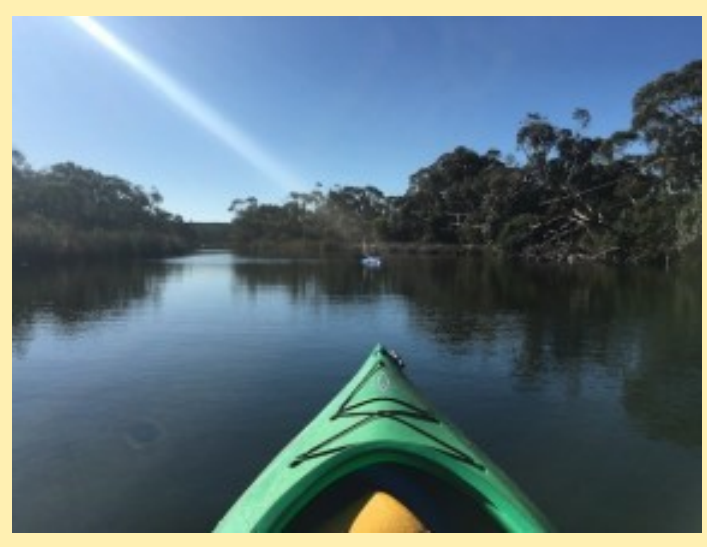
to have a chat.

The paddling was easy, the water was flat and we had a slight tail wind. The easy progress gave everyone a chance